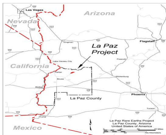
Figure 1: Location of La Paz Scandium & Rare Earths Project in Arizona USA.

Additionally, the local community of La Paz County has been exceptionally supportive. Notably supplying the water needed by the drilling crew in short order at a fair market price. (See attached letter from La Paz County Board of Supervisors) The Economic Development Agency of La Paz County and elected County Supervisors have made this project a top priority for support due to the potential for bringing jobs to a high poverty area. (See attached letter of support)